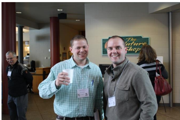
Ohio Chapter Members